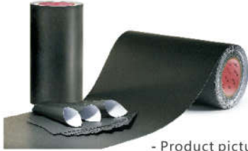
- Product picture -

Smaller and thin are required with the development of electronic products, it is more important to RFID anti-metal reader and tag, EMI component, Wireless charge products and Electro Magnetic Screen technology etc. Absorber material appeared to solve this problem. It has ultra-thin, soft, easily to roll up and cut performances, it can be custom-made, and also available for laminate with shielding materials like metal foil and fabrics as a multi-layer construction.